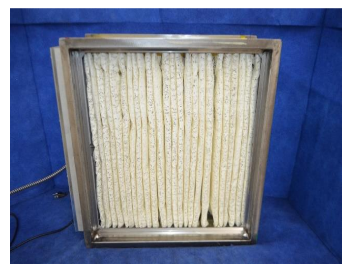
Filter with UV lights